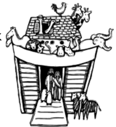
Sunday School News

Sunday School will be starting Sunday, September 11th. (This is our first Sunday back at our 10am service time) Anyone who is interested in helping teach on Sunday mornings to our little ones, please let me know. We have a rotation schedule so NO ONE has to teach every week. Sunday school is for children ages 3 - 2nd grade. Please contact me to let me know if your child will be joining us this fall.