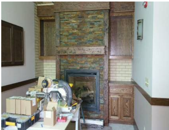
Above: Pastor's office