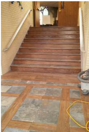
Foyer floor and stairs to the Sanctuary