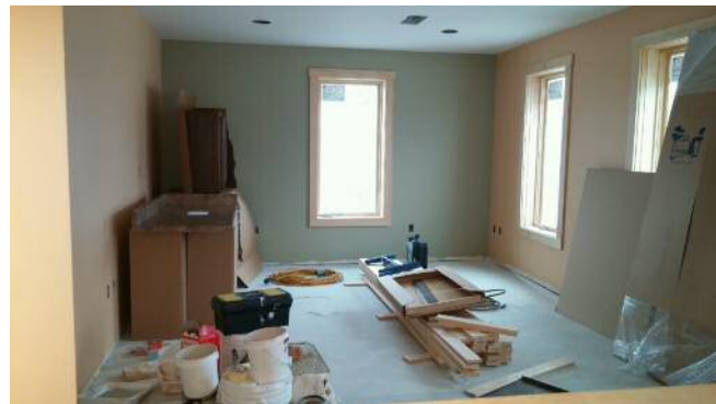
Left and below: