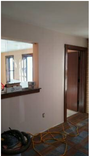
Church office painted and window installed