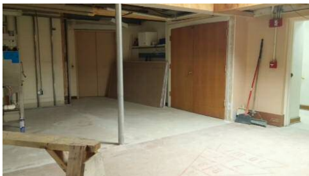
Right and left: Old kitchen demolition